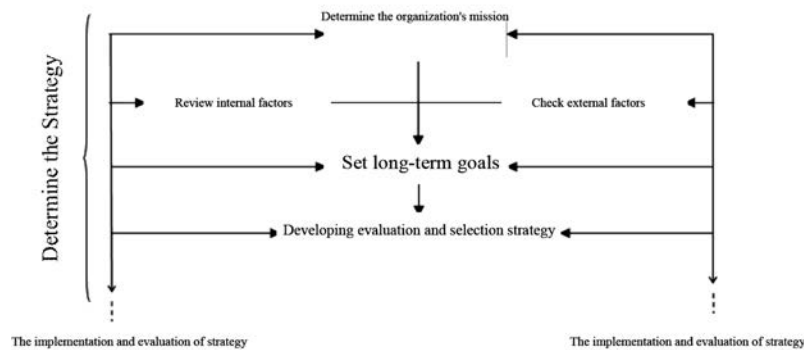
Fig. 2: Strategic document for recycling

activities, deciding to expand activities, development and even merging with or joining new companies and overcoming challenging factors are also considered during this stage (Aich and Ghosh, 2016). In short, strengths and weaknesses (internal factors), opportunities and threats (external factors) to solid waste recycling system are identified and analyzed in this method and finally strategic document for recycling organization in Zahedan is developed and presented (Fig 1 and 2).