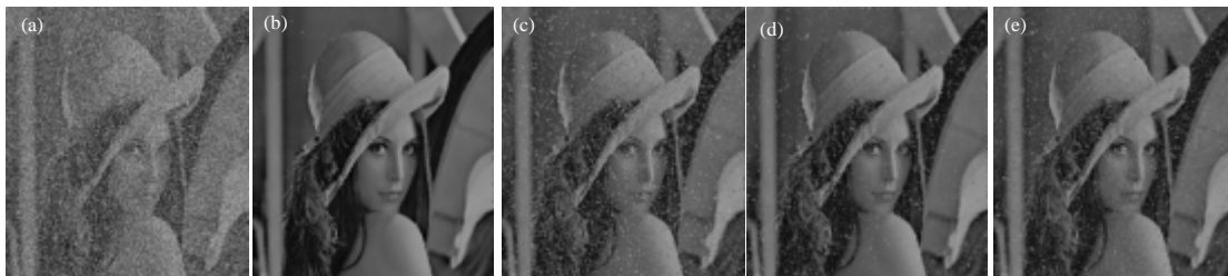
Fig. 1: Output images from different filters for the 50% corrupted Lena image: a) Noisy lena image; b) Proposed method (PA); c) ACWMF; d) PW-MAD and f) CEF

The restoration results for Lena test image corrupted with 50% Impulse noise are illustrated in Fig. 1. The proposed method output is compared with Adaptive Center Weighted Median filter (ACWMF), Pixel Wise MAD (PWMAD), Contrast Enhancement based Filter (CEF). It is clearly seen from qualitative results. That the proposed filter preserves edge sharpness and shows better performance in noise detection compared to other filters. The simulation results obtained are compared with the existing methods in terms of parameters such as PSNR and MAE values for test images Lena and flowers are analyzed in different noise density. PSNR and MAE values for different noise density input images are calculated in Table 1, 2 and Fig. 2, respectively. The PSNR value comparison between the proposed method and existing methods are deliberated. It is clear that the proposed method produces better denoised image with high PSNR while compare to other filters. PSNR value decreases for high noise density input images increases. High PSNR is obtained when the noise density is low. Even though, the proposed method produces better denoised image than other filters both in high and low noise density. It shows better tradeoff between impulse noise detection and image enhancement.