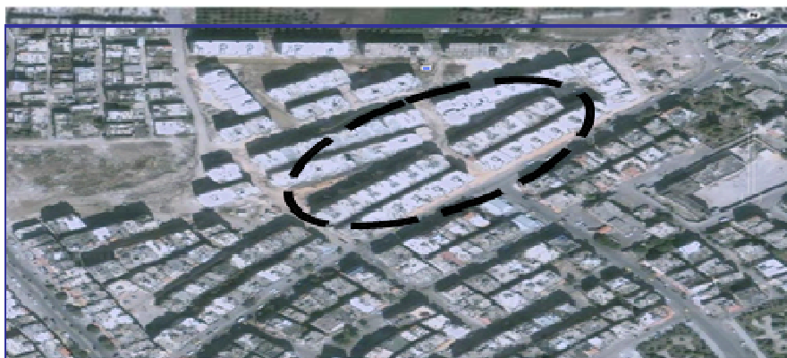
Fig. 2: A satellite image of the studied quarter in Lattakia-Syria (Google Earth)