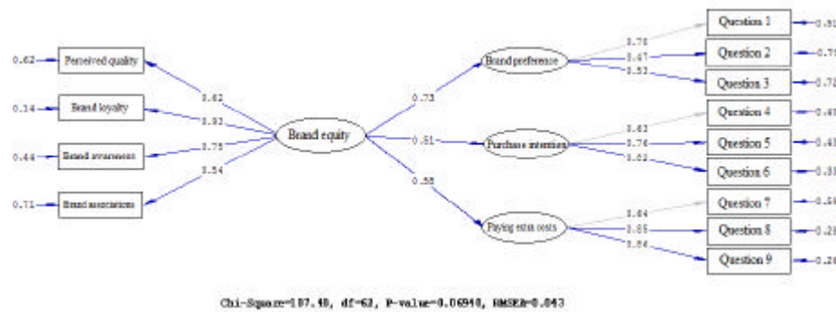
Fig. 2: Structural equation modeling of the conceptual model (standard estimation)