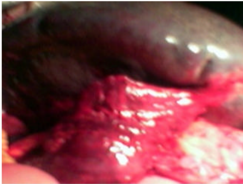
Fig. 1: Oedematous splenic pedicle