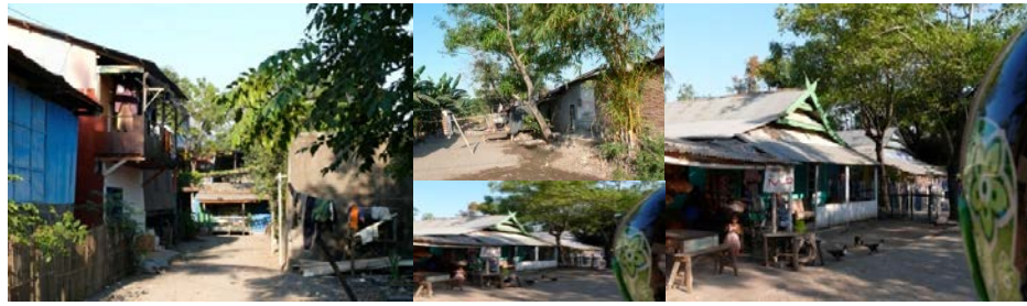
Fig. 2: Slum area environment at the urban fringe of Makassar City

always direct and control their employees and production. Relation between the master and his servant which will associate with class division and frictions is stimulus for formation of co-existence of mode of production which will occur.