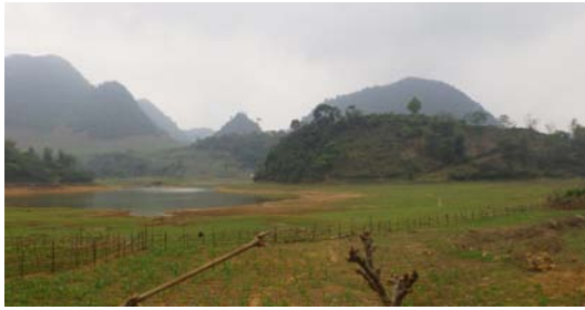
Fig. 3: The decrease water level in this lake is indicated by the expose bare soil (yellow) and a long period of decrease as short green grass on the muddy and sometime fill with sinkhole area as observed in this commune

Bac is among the poor group with 2-3 million VND/person/year. The poor group often involved in agriculture production account for 75% of the correspondent while others, 25% are contribute by providing services and serve as government and local officer. Most of the agriculture production, made up of 80%, practices mixed cropping system in which the farmer sow two crops at the same time while another 20% are ventures to livestock breeding (GSOHB, 2014). The mixed cropping agriculture practices are viable in this mountain as the seasonal crop and livestock breeding calendar of Da Bac District (Table 1) shows that some of the plant such as sugarcane and cassava are all season while the staple plant, paddy, only can be planted and harvest within 7 months while maize and potato for 8 month and canna tubes for 9 month. Livestock breeding become the next alternative as the raising of pig, buffalo, cow as well as aquaculture are also practical all year round.