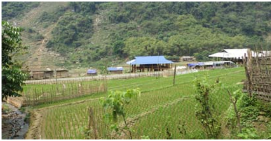
Fig. 2: Main economic activities in the area is terrace paddy planting often on the narrow area. In this photo is between two limestone hill at most Northern part of the Da Bac District