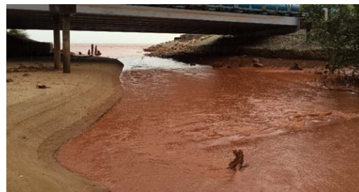
Fig. 1: View of the sampling location in Pengorak River

Experimental approach: Soil sampling was carried out at selected sampling site located at Pengorak River (3°58'08.7"N, 103°24'36.7"E). Figure 1 shows the condition of the site during collection. Red mud flows directly to the sea and turn both the beach and the ocean red.