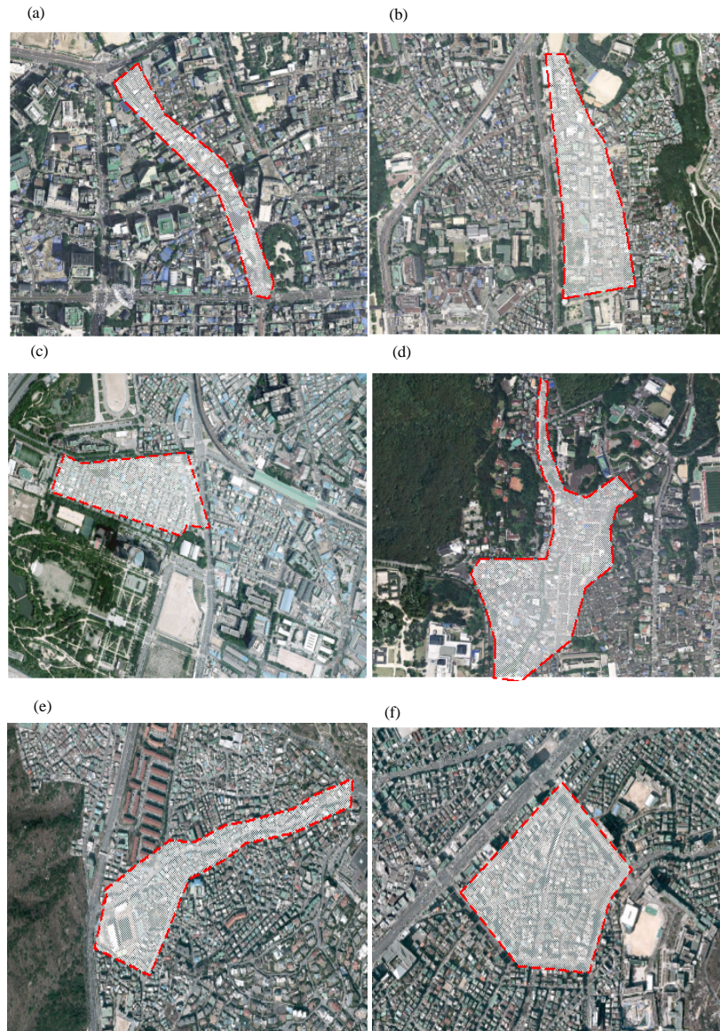
Fig. 2: Research Area