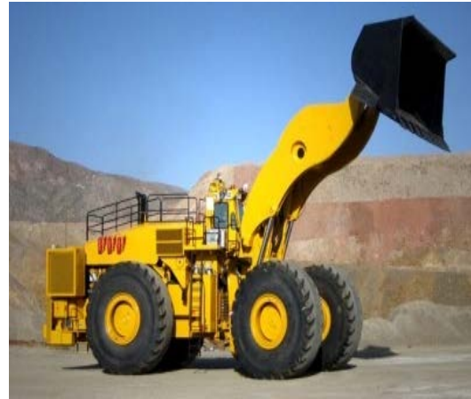
Fig. 3: Le Tourneau L-2350 front end loader

Review of the trend in using mining and loading equipment in open pit operations shows an increase in the number of powerful hydraulic mining excavators with front and backhoe shovel in the overall fleet of mechanical shovels. During this study, deliveries of mining and loading equipment to the Russian market were reviewed based on the data available from public media and specialized literature.