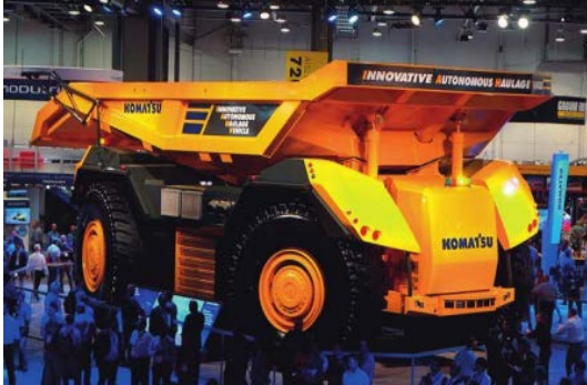
Fig. 1: Komatsu IAHV unmanned haul truck