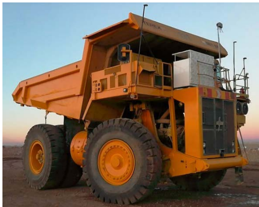
Fig. 2: BelAZ unmanned haul truck

Robotics from Russia, a subsidiary of VIST Group, tested an unmanned BelAZ haul truck in Morocco (Fig. 2) (Pikalov et al. , 2016).