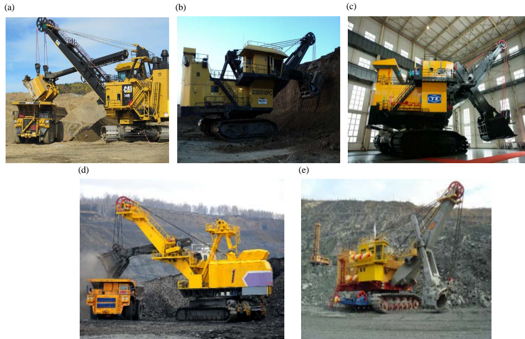
Fig. 4: Rope excavators with front shovel: a) Caterpillar; b) P&H; c) TYHI; d) IZ-KARTEX and e) Uralmashplant