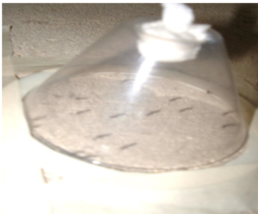
Fig. 1: Plastic cone containing mosquitoes attached to cement insecticide treated surface

mortalities were computed from the total alive and dead mosquitoes for each type of surface. Knockdown mortality was calculated from the percentage of mosquitoes lying on their backs or sides rather than resting on their legs and was done by visual examination. Where control mortality was between 5-20%, data was corrected by applying the Abbott's formula (Abbott, 1925). When mortality in controls exceeded 20%, test results were rejected or repeated. The WHO criterion for persistence level of at least 70% mortality at week 8 after spraying was used as a standard reference (Najera and Zaim, 2001). The results were used to express the overall persistence of ICON on various wall surfaces.