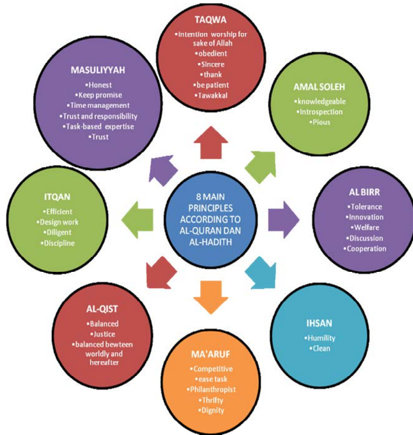
Fig. 1: Principles of Islamic work ethic

papers and using the analytical and critical methods, to discuss knowledge-oriented initiatives by Malay Muslim writers in Malaysia on Islamic work ethic. Thus, given the principles outlined above on Islamic work ethic, this study examined a total of 30 literatures written by Malay authors which have explained the principles of Islamic work ethic and try to see how these are in tandem with the concepts of Islamic work ethic discussed in the section above. This study is based on writing, stating the principles of Islamic work ethic, written by Malay scholars in Malaysia.