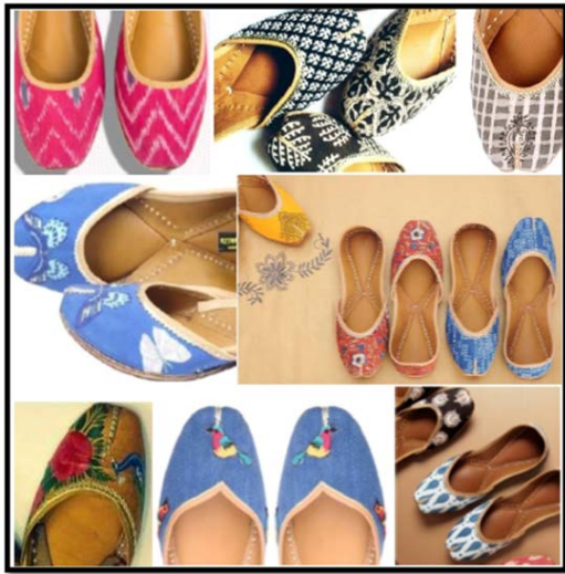
Fig. 4: Traditional prints used for footwear

Craftsmen use hand carved wooden blocks to stamp designs onto the cloth with natural techniques. It also gives formal look to the traditional footwear and on low prices customers get beautiful and simple juttis (Mishra, 1964). Now, Denim, silk, hemp, cotton etc. are the natural fabrics used for shibori and cellulose fibers such as cotton, hemp, rayon and linen are used for tie and dye or bandhani. Natural prints of two colours [11] are created on the different natural fabrics in different popular ways and those fabrics are used on the upper part of jutti to give the traditional footwear a formal appearance. Different flowery and geometrical motifs along with their intermixtures, numerous patterns are created and used to decorate traditional footwear. Paisley motifs or bootah or floral motifs are also very ancient and are used to embellish juttis. Kalamkari or qalamkari is a type of hand-painted or block-printed cotton textile, produced in Iran and India. Its name originates in the Persian which is derived from the words qalam (pen) and kari (craftsmanship), meaning drawing with a pen practiced in Andhra Pradesh, particularly in Kalahasti and Machilipatnam, now also popular for Punjabi juttis.