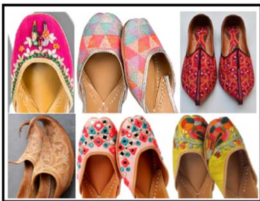
Fig. 3: Regional embroideries and designs

Handmade and machine-made, both type of phulkari or gulkari embroidery inspired by flowers have roots on the land of Punjab. Geometrical forms in same technique is called bagh or square garden. Both, geometrical and floral motifs are popular to embellish juttis. It has infinite number of patterns testifying to the creative ability of the needlewomen, make up of parallel, straight down and slanting stitches. Apiece variability has a distinct label as bagh and every bagh in turn has a different name like shailmarbagh, Lahoribagh, kakribagh, mirchabagh, dunyabagh, grounded on the different patterns which offers the particular design its appellation. The remarkable fact is that with the skillful manipulation of the darning stitch so miscellaneous ranges of intricate designs are shaped with an entire effect of floral grandeur [4] .