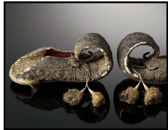
Fig. 1: Zardosi footwear, Museum no. 0515 (IS), Victoria and Albert Museum, 1855, Lucknow

Mughal dresses along with footwear (Fig. 1) were also made of golden-silver zardozi embroideries as there are various Mughal miniatures (British Museum, nos. 1949, 1210, 0.10 and 1974, 0617, 0.10.10 and 1920, 0917, 0.13.6. Also see Cleveland Museum, No. 1917.1066, 2013.293, 2013.323, 2013.324 and 2013.313. Also see Asian art museum, No. 1998.94), in which examples of Mughal zari embroidered footwear also depicted with various designs and colours. Detailed descriptions are also available in Ain-a-Akbari and Tuzuk-i-Jahangiri about Mughal zardozi centers. Centers of zardozi also changed with Mughal capitals time to